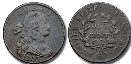
LOT 566 1803 S-262 R-3 VG10+. VF25 sharpness but covered with uniform granularity on both sides.