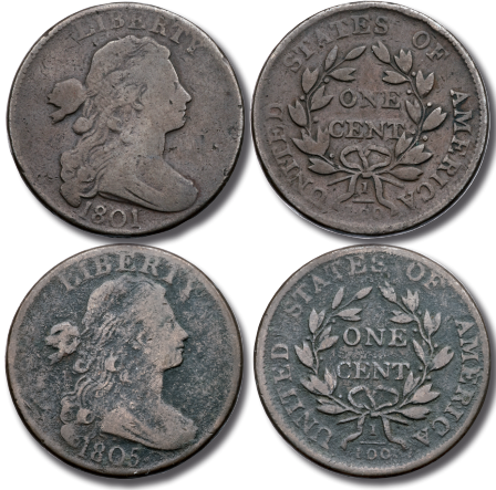
LOT 559 Pair of 1801 & 1805 Large Cents. Pair of Large cents, including an 1801 S-224 R-1 MDS G6, and an 1805 S-269 R-1 VG10 net G6 for light corrosion.