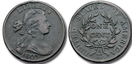
LOT 564 1803 S-256 R-3 F15+. Five points sharper but there are several minor rim bumps. The most notable are under 1, above IB in LIBERTY, below the fraction, and at CA in AMERICA. Smooth, hard surfaces. Rather glossy dark olive and steel browns, a shade or two lighter on some high points. LDS, Breen state VI, with a reverse rim break at STA.