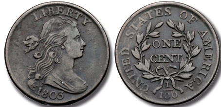
LOT 565 1803 S-258 R-1 F12. VF20 sharpness but there are several scratches across TED-STA and a spot of verdigris at BE in LIBERTY. The only other marks are a rim bruise right of the date and a bit of grainy crud in some reverse protected areas around the lower wreath. Otherwise mostly olive brown with deeper maroon outlining the devices. M-LDS, Breen state III.