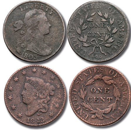
LOT 563 Pair of 1803 & 1823/2 Large Cents. Pair of Large cents, including an 1803 S-243 R-2 EDS F12 net VG7 for granularity, and an 1823/2 N-1 R-2 F12 net G5 for granularity and cleaning.