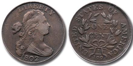
LOT 560 1802 S-232 R-1 PCGS VF30. Attractive glossy chocolate brown with lighter steel on some high points. There is a small arc shaped pin scratch through the tops of IBE, no other notable marks. Smooth and attractive for the grade. MDS, Breen state IV. Our grade is F15. 20936110