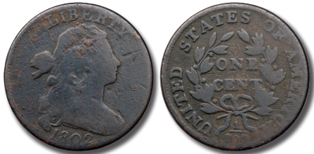
LOT 561 1802 S-237 R-2 G5. A point or so sharper but there are scattered pits and ruddy old scale on either side, most notably in the upper hair and before the neck. Otherwise dark steel and olive surfaces. Full date and legends.