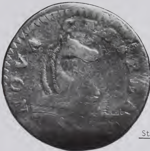
Plate example: None traced

The numerals 1 & 7 are totally engulfed in die sinking. The bottom half of the 8 is visible. On the reverse only a ghost impression of the I is visible. The adjacent B on its left side begins to show signs of fading.