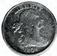
Note second hair notch