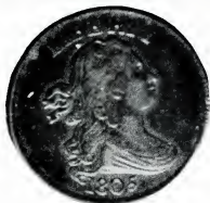
Normal 1805 C-1

I obtained the piece from a young chap who is a new dealer on Cape Cod. He did not venture any information as to where he had gotten the coin. He did mention that another dealer had seen the piece recently and this dealer gave the opinion that the coin was not authentic. However, he wanted to buy the coin for $100. When I saw the coin, it was marked at $275. I obtained the piece in a swap for two other half cents.