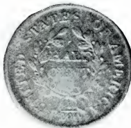
Reverse of coin described

Can any one offer an explanation for the coin? Your correspondence is solicited. I can be reached at 6 Colonial Road, Wilbraham, MA 01095.