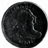
Double profile coin